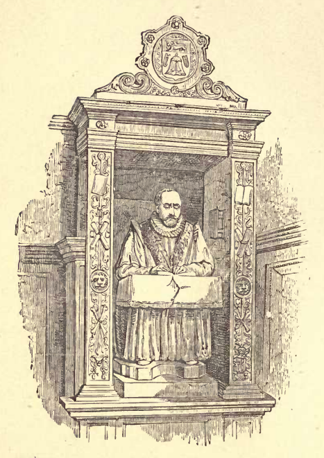
STOW'S MONUMENT, IN THE CHURCH OF ST. ANDREW UNDERSHAFT, LONDON.